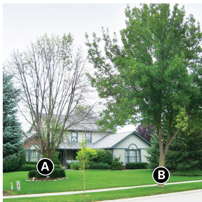
Untreated Ash Tree (A) Compared to an Ash Tree Treated with Arborjet (B)

For less than the cost of your monthly cable and internet bill, SAVE A TREE FOR 2 YEARS!